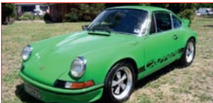
1988 PORSCHE 911 RS REPLICA COUPE Starting with a 3.2ltr- G50- 911, the car was totally stripped and professionally rebuilt to RS appearance Plus mechanical upgrades. Only had minimal use since completion. With Vic RWC and Reg. REG NO :0911RS $79,950