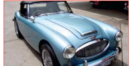
1962 AUSTIN HEALEY BJ7 3000 MK2A CONVERTIBLE The past owner has progressively improved this Wind-Up Window Big Healey. Excellent on road performance and handling. Very reasonably priced. With Vic RWC, Reg and AMMK11Plates. REG NO: AHMK11 $57,500