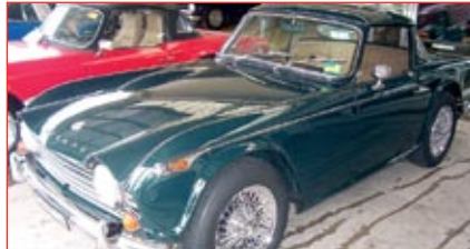
1966 TRIUMPH TR4A IRS ROADSTER Totally Ground-Up Restored to a very high standard. Way too many features to list here – Call today for full details and to book your test drive and on-hoist inspection. With Vic RWC and 12 months Reg. CHASSIS NO: CTC65272C $38,500