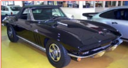
1966 CHEVROLET 427 CONVERTIBLE Rarely offered Big Block Chevy. Quality Straight and Original Corvette. Drives very well. Stunning USA Muscle Car. With Vic Roads Reg and 12 months Reg. CHASSIS NO: 194676S125303 $79,900

E-MAIL: healeyfactory@redcentre.com WEB SITE: www.healeyfactory.com.au