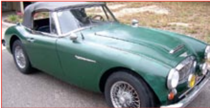
1966 AUSTIN HEALEY BJ8 3000 MK111 CONVERTIBLE Very late model Phase 111 Healey still in LHD configuration. For the competent enthusiast to restore or allow us to do it for you. To be delivered as displayed. CHASSIS NO: HBJ8L37459 $35,000