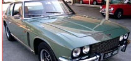
1971 JENSEN INTERCEPTOR MK2 COUPE Victorian delivered Interceptor that has been extensively Up-Graded and Restored by Melbourne Jensen specialists. Very fine example of the Marque. With Vic RWC and Reg. REG NO: LBE 444 $45,000