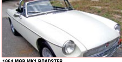
1964 MGB MK1 ROADSTER Enthusiast restored to a high standard by the enthusiast owner, this Early Pull Out Handle 'B' will delight the discerning enthusiast. Book your test drive and on-hoist inspection today. With Vic RWC and Reg. REG NO: OPN 744 $17,900