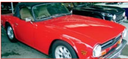
1971 TRIUMPH TR6 ROADSTER Fully documented professional Ground-Up Restoration completed in 2009. All Body, Trim and Mechanicals Rebuilt. One of the finest TR's we have had the pleasure of offering. With Vic Roads RWC and 12 months Reg. CHASSIS NO: CC62274L $35,000