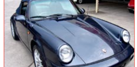
1990 PORSCHE 911 CABRIOLET Melb delivered with books and history, this 964 Series, 3.6ltr Cabriolet drives as well as it looks. With Fully Operative Cold Air Conditioning. With Vic RWC and Reg. REG NO: POY 711 $45,000