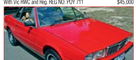
1988 MASERATI BI-TURBO SPYDER CONVERTIBLE Aust del with books and history. V6 Twin Turbo Engine and Four Wheel Disc Brakes. Makes for exhilarating motoring. With Vic RWC and Reg. REG NO: SQF 343 $19,900

Austin-Healey Triumph Daimler Jaguar Lotus MG AC Allard Jensen Morgan Sunbeam Aston Martin