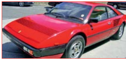
1985 FERRARI MONDIAL 3.0 QUATTROVALVE COUPE Aust del with books and service history, this fine 3.0ltr V8, Manual 5 speed Ferrari is in excellent condition throughout. Only 98000 kms from new. With Vic RWC and 12 months Reg. ENGINE NO: 1105A02400051 $56,500